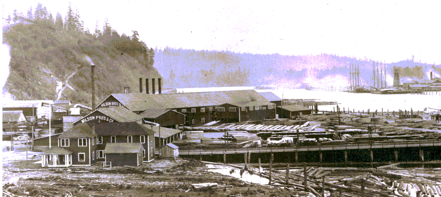
Wilson Bros. Mill, ca. 1915 (at the present site of the Wishkah Mall)