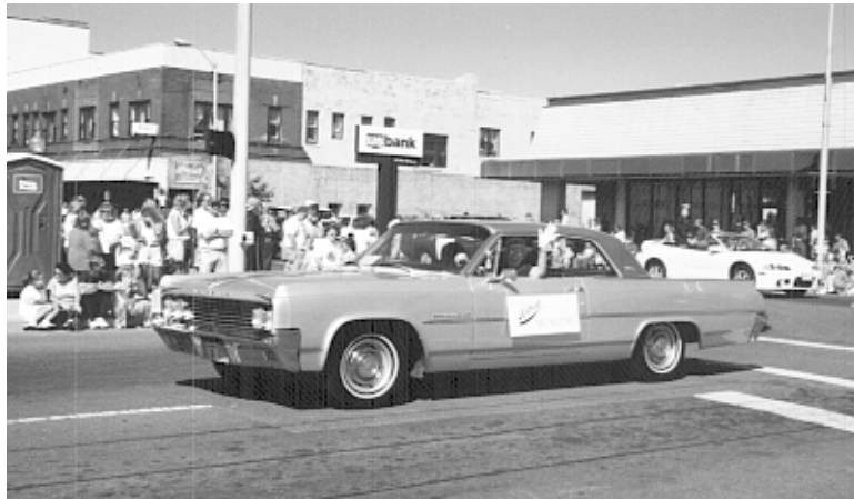
Alta Reay waves to the crowd at the Loggers Playday Parade